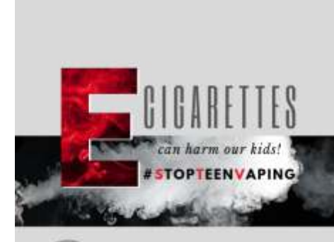
ATTORNEY GENERAL'S FACT-GATHERING MISSION TO STOP TEEN VAPING