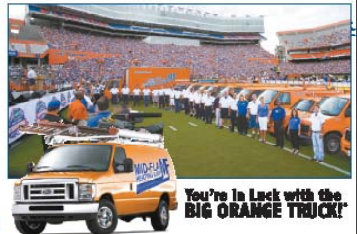
You're In Luck with the BIG ORANGE TRUCK!

It's easy. Just call one of my dispatchers and they will schedule a Champion Technician to your home. We service ALL brands.