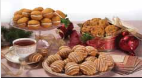
From left: Mini Pumpkin Whoopie Pies, Old-Fashioned Soft Pumpkin Cookies and Pumpkin-Oatmeal Raisin Cookies