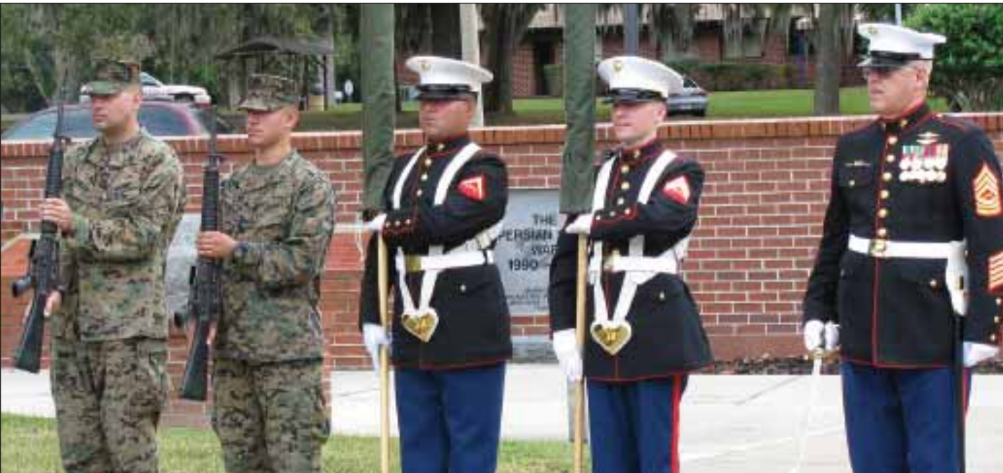
Above are pictures of the ceremonies that went on at veterans park on veterans day. It's all about the veterans. Without them we would not have the freedoms we have today. We honor you!

Talking about Long-Term care facilities is easy for me, because I enjoy what I do as a volunteer with the Ombudsman Program. As I have stated many times in my column, it is the most rewarding volunteer program that anyone could want to get involved in. The program does not ask for much, 20 hours a month from it's volunteers and the attendance at one monthly meeting. A volunteer can put in as much time as they want and will not be limited to 20 hours a month, the choice is theirs. The first thing a volunteer has to do is to fill out the proper paper work (application) and have a background check. After that there is training for 3 days, of which part of the three days are in the field.