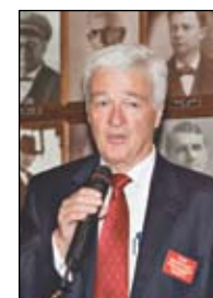
Don Browning For Congress District 6