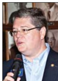
Kurt Kelly For Congress District 8