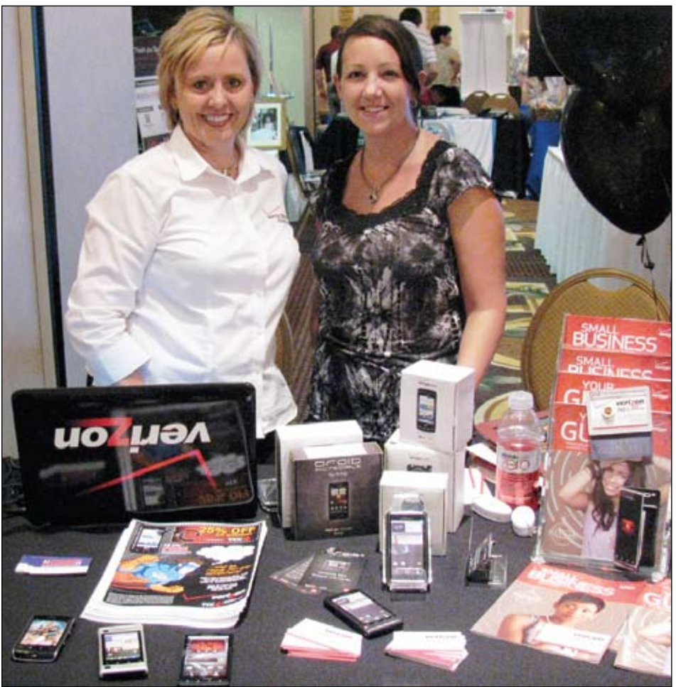
Expo Pictures & Story Page 8