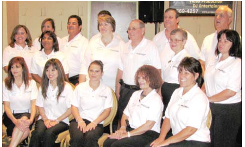
Pictured are the Main Street Chamber Ambassadors. This picture was taken at the Holiday Inn Hotel, Main Street Chamber kick off event. They are charged with making sure the events run smooth and everything is organized. They did their job!