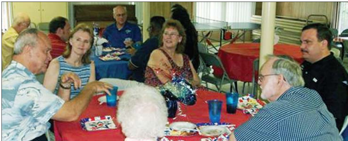
Pictured is City Parks and Recreation having an open house for the Ocala businesses and some college students. They displayed some of the games available for people attending the summer program.