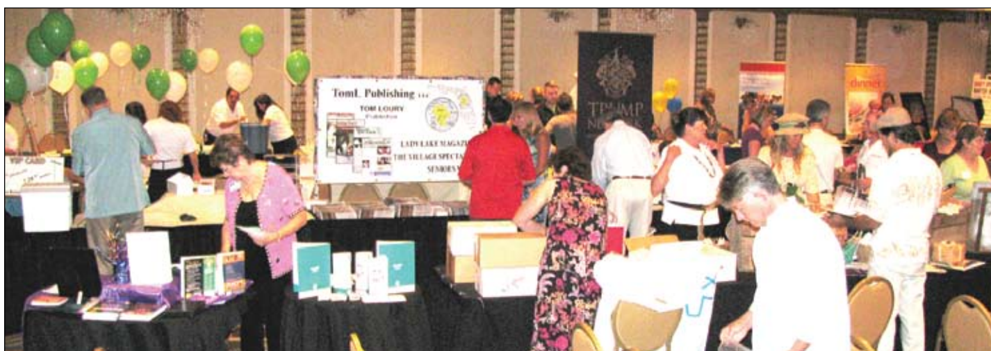
Pictured are some 50 vendors just before the doors opened to let hundreds of people come through to check out their services and products. The event was to experience the kick off of the Main Street Chamber