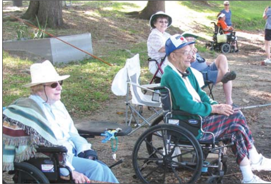
Relaxing in the shade and enjoying the outing.