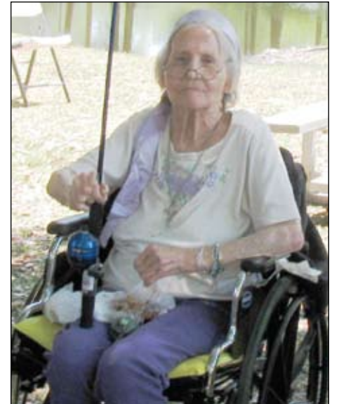
One senior netted a rod and reel during the drawing. Rod and Reel donated by TomL Publishing.