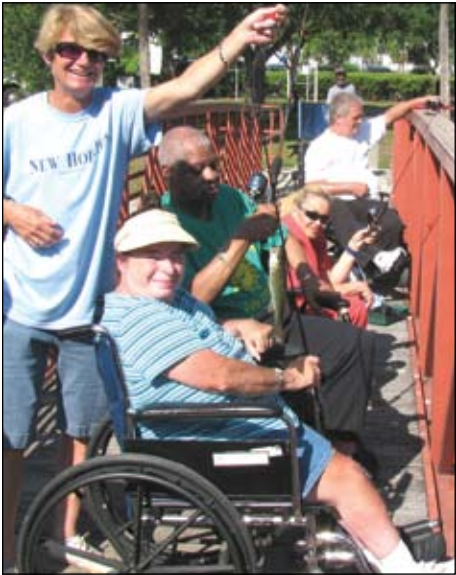
Seniors fishing on the bridge on the south end of Lake Tusawilla get help from their caregivers.