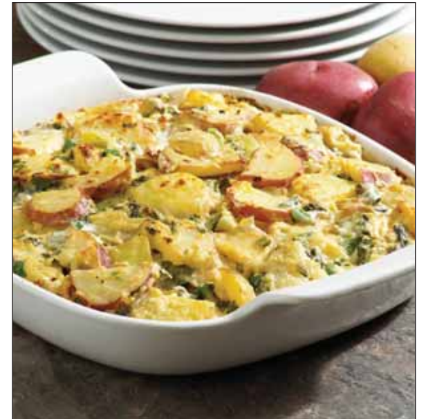
(Continued on Page 14)

Spread in prepared dish and bake for 30 minutes. Cover loosely with foil and reduce