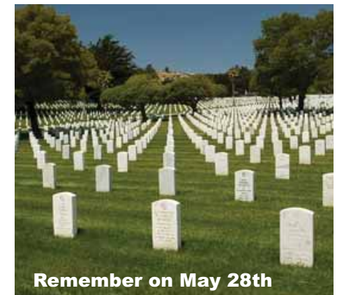
Remember on May 28th