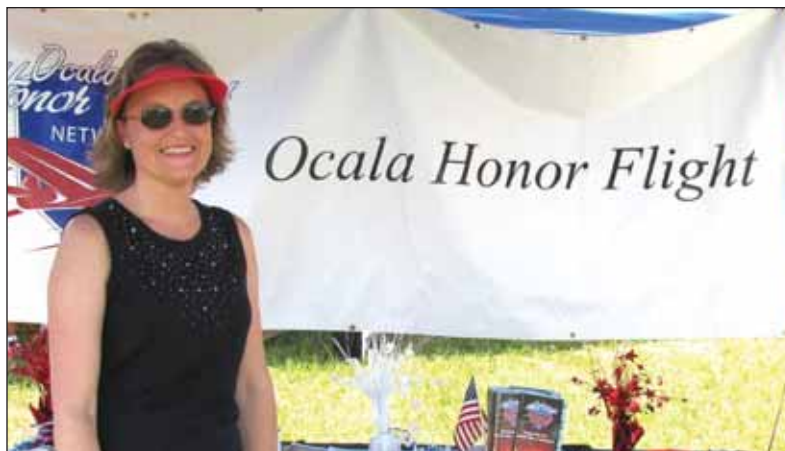
Ocala Honor Flight