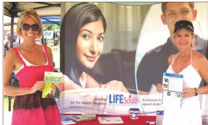
Life South Volunteers