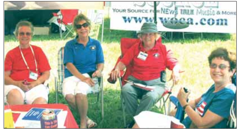
Marion County Tea Party