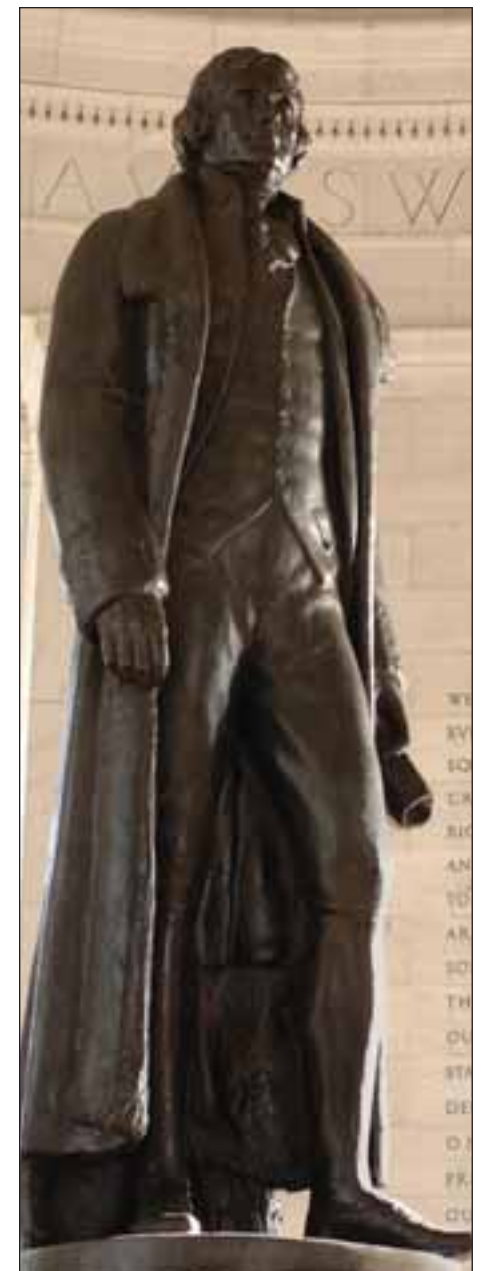
Interior of Jefferson Memorial in Washington, D.C. with Jefferson in front and inscription of the Declaration of Independence to the right.