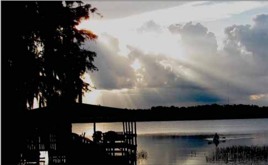
I stayed at the Hamilton Lake Bed & Breakfast last week. I did not know what to expect because I had never stayed at a Bed & Breakfast. The setup was pretty neat actually. Each person had a bedroom with a big bathroom and a common living area, kitchen and porches. Wireless was available and my room had a desk and a jacuzzi. I had to work on this paper some. Pictured is my wife Phyllis paddling a Kayak at sunset. The sunset was so interesting I took pictures and this is one I came up with. TomL