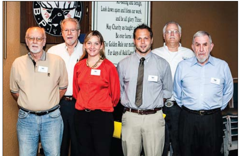
Ocala Business Leaders induct some new members. If you would like to increase your business Come Have Breakfast On Us! Every Wednesday at 7 Am Ocala Elks Lodge, 702 NE 25th Avenue Ocala, Florida.