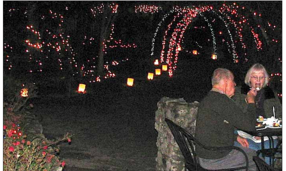
Rainbow Springs Dunnellon, Florida. This picture was taken on volunteer night and the test run for the lights for Santa over the Rainbow. Refreshments were served and the lights were fantastic.