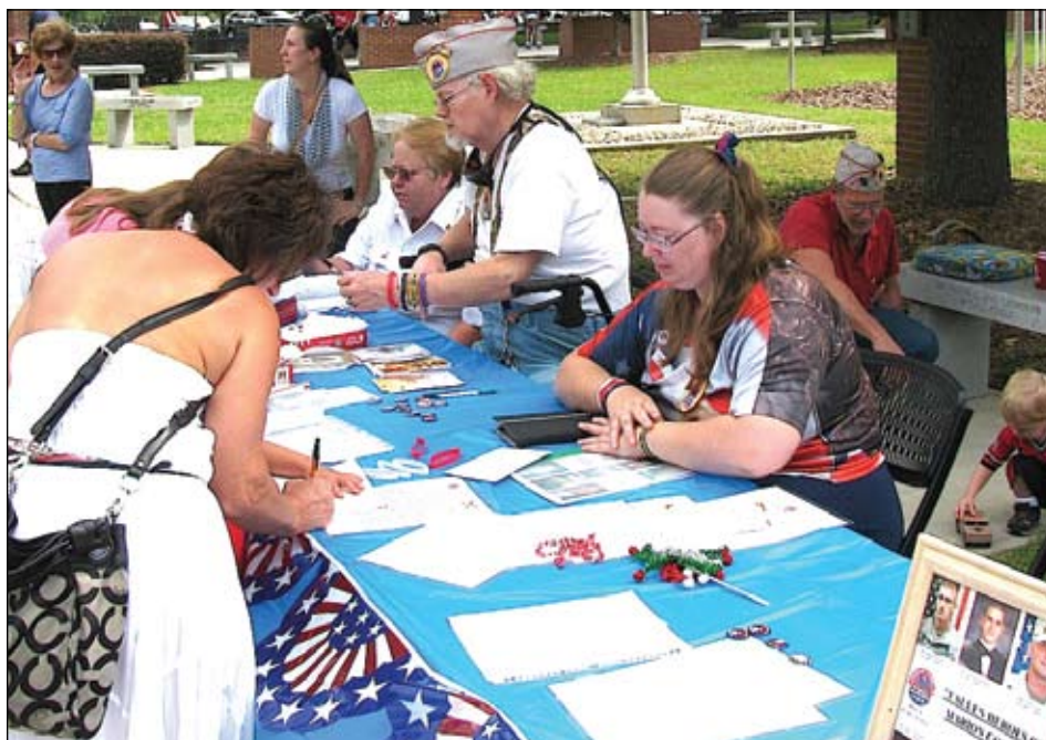
Thousands showed up Memorial Day at Veterans Memorial Park in Ocala, FL to remember and honor our brave soldiers. Flags were displayed and the history was told about how the American Flag came about. Some of our representatives spoke, we pledged allegiance to the flag, and we prayed over our troops. . "It was truly a day to remember."