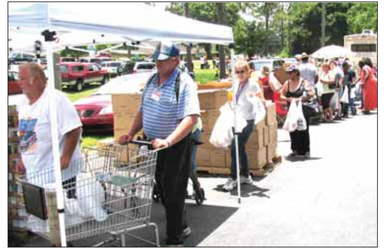
Gateway to Hope Food Giveaway. Pictured are people in line waiting to get their food. Approximately 7,000 lbs of food was given out this day. Even in the heat people were optimistic and all received their food.