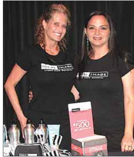
Shown above and right are pictures of the Buy Local Expo. Story and more pictures are located on page 7.