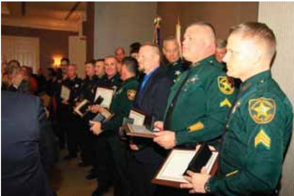
MCSO SWAT team and various patrol deputies receiving their Medals of Honor for acting bravely in apprehending an armed subject during a standoff.