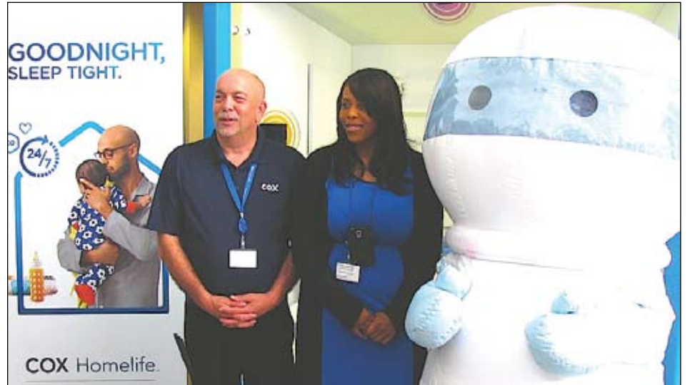
The 2015 Home, Garden & Lifestyle Expo was a great success. It was held at the Klein Conference Center in the Ewer's Century Center at the College of Central Florida. As you walk in the reception area and to your right was this COX display that covered a whole wall. Cox is a Platinum sponsor for the event. Some 50 plus vendors were displaying in the Ewers Century Center. View more pictures on page 6.