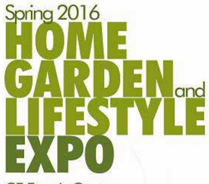
CF Ewer's Center 3001 Southwest College Road, Ocola, FL 34474

When: Mondays, Wednesdays and Fridays continuing thru April 18th, 2016