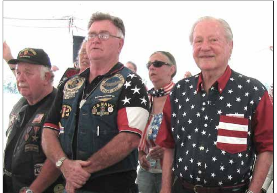
Former Prisoners of War, Vietnam Veterans honored during Memorial Day Ceremony.