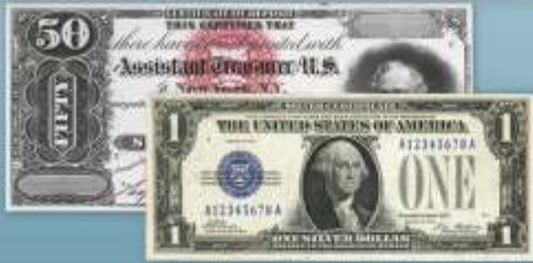
U.S. & Foreign Paper Money