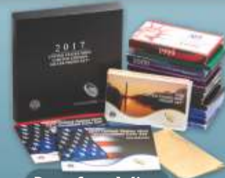
Proof & Mint Coin Sets