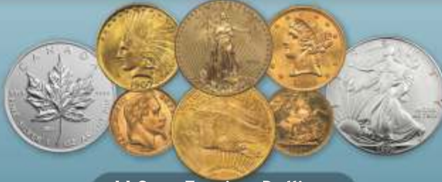
U.S. & Foreign Bullion Gold & Silver, & Platinum