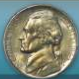
Silver War Nickels 20¢* up to $2,700