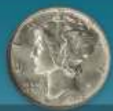
Mercury Dimes $0.95* up to $5,800