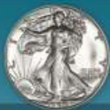
Walking Liberty Halves $4.50* up to $12,000