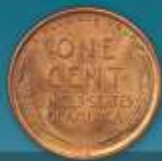
Wheat Cents 1.2¢* up to $2,500