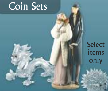
Swarovski & Lladro Figurines