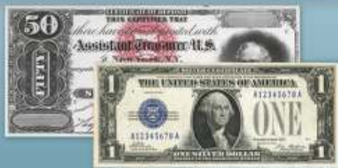
U.S. & Foreign Paper Money