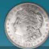
Morgan Dollars $10* up to $55,000