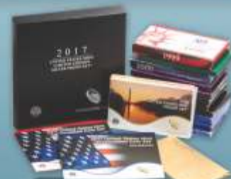
Proof & Mint Coin Sets