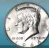
Pre-'65 Halves $4.50* up to $8