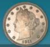
'V' Nickels 20¢* up to $1,300