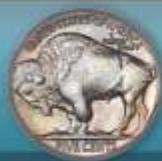
Buffalo Nickels 20¢* up to $2,700