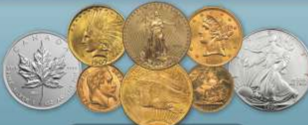
U.S. & Foreign Bullion Gold & Silver, & Platinum