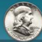
Franklin Half Dollars $4.50* up to $36