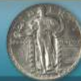
Standing Quarters $2.25* up to $2,800