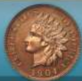
Indian Cents 20¢* up to $5,000