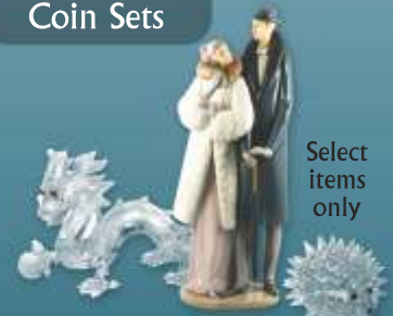
Swarovski & Lladro Figurines