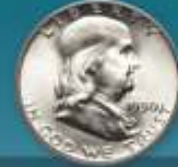
Franklin Half Dollars $4.50* up to $36