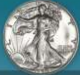
Walking Liberty Halves $4.50* up to $12,000