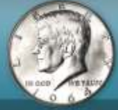
Pre-'65 Halves $4.50* up to $8