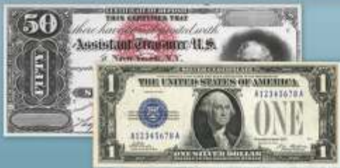
U.S. & Foreign Paper Money