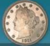
'V' Nickels 20¢* up to $1,300