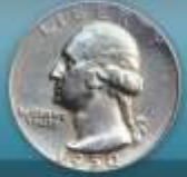
Pre-'65 Quarters $2.25* up to $400