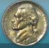
Silver War Nickels 20¢* up to $2,700