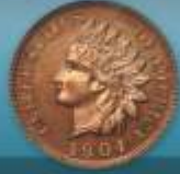
Indian Cents 20¢* up to $5,000