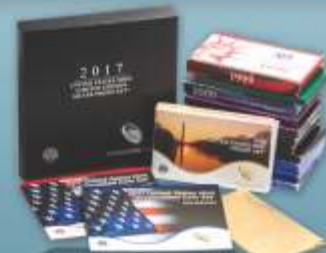
Proof & Mint Coin Sets