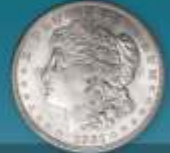
Morgan Dollars $10* up to $55,000