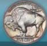
Buffalo Nickels 20¢* up to $2,700