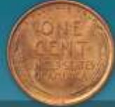
Wheat Cents 1.2¢* up to $2,500