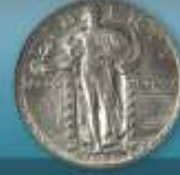
Standing Quarters $2.25* up to $2,800