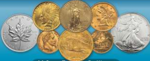
U.S. & Foreign Bullion Gold & Silver, & Platinum