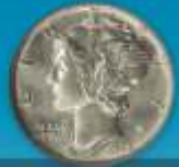
Mercury Dimes $1.15* up to $5,800