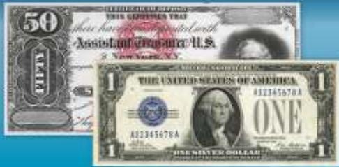
U.S. & Foreign Paper Money