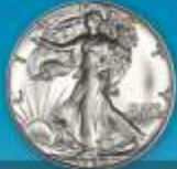
Walking Liberty Halves $5.75* up to $12,000