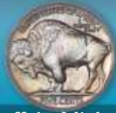
Buffalo Nickels 20¢* up to $2,700