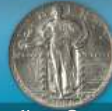
Standing Quarters $2.85* up to $2,800