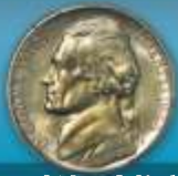
Silver War Nickels 20¢* up to $2,700