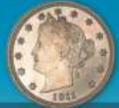
'V' Nickels 20¢* up to $1,300