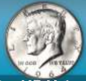
Pre-'65 Halves $5.75* up to $8