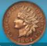
Indian Cents 20¢* up to $5,000