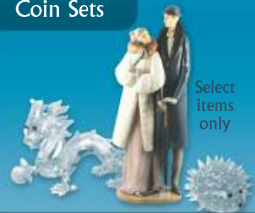
Swarovski & Lladro Figurines