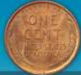
Wheat Cents 1.2¢* up to $2,500