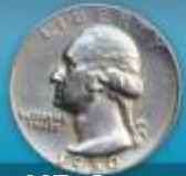
Pre-'65 Quarters $2.85* up to $400