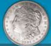
Morgan Dollars $11.50* up to $55,000