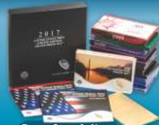
Proof & Mint Coin Sets