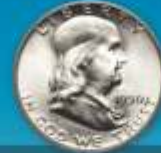
Franklin Half Dollars $5.75* up to $36