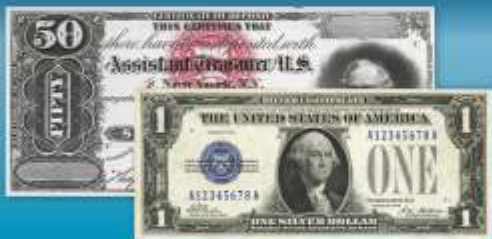
U.S. & Foreign Paper Money