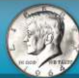
Pre-'65 Halves $5.75* up to $8