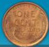
Wheat Cents 1.2¢* up to $2,500