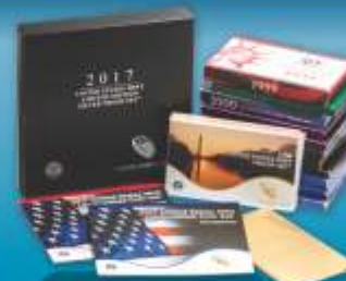
Proof & Mint Coin Sets