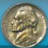
Silver War Nickels 20¢* up to $2,700