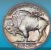
Buffalo Nickels 20¢* up to $2,700