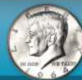
Pre-'65 Halves $5.75* up to $8