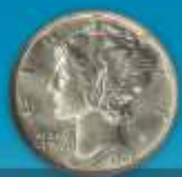
Mercury Dimes $1.15* up to $5,800