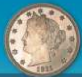
'V' Nickels 20¢* up to $1,300