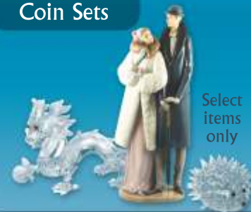
Swarovski & Lladro Figurines