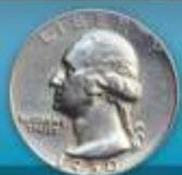
Pre-'65 Quarters $2.85* up to $400