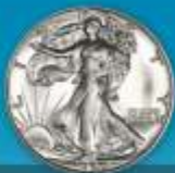
Walking Liberty Halves $5.75* up to $12,000