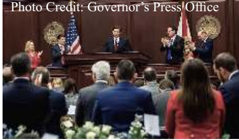
Governor Ron DeSantis Gives State of the State Address

Tallahassee, Fla. – Today, Governor Ron DeSantis delivered the State of the State address to a joint session of the Florida Legislature and Floridians everywhere, highlighting Florida's strengths while reporting on the promising prospects for the future with the support of the House of Representatives and Senate.