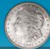
Morgan Dollars $11.50* up to $55,000