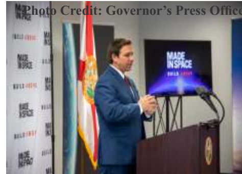
will involve more than $3 million in new capital investment for Jacksonville.

Jacksonville, Fla. – Today, Governor Ron DeSantis announced that Made In Space has decided to relocate their corporate headquarters and satellite manufacturing operations from California to Florida. The headquarters relocation and expansion effort