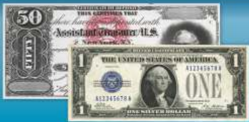
U.S. & Foreign Paper Money