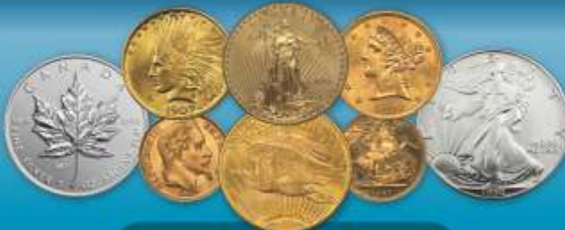
U.S. & Foreign Bullion Gold & Silver, & Platinum