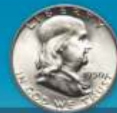
Franklin Half Dollars $5.75* up to $36