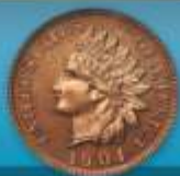
Indian Cents 20¢* up to $5,000