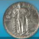
Standing Quarters $2.85* up to $2,800