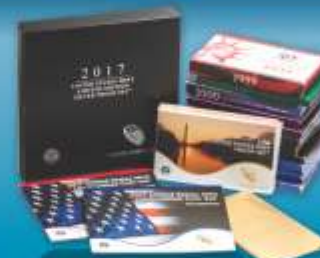
Proof & Mint Coin Sets