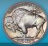
Buffalo Nickels 20¢* up to $2,700