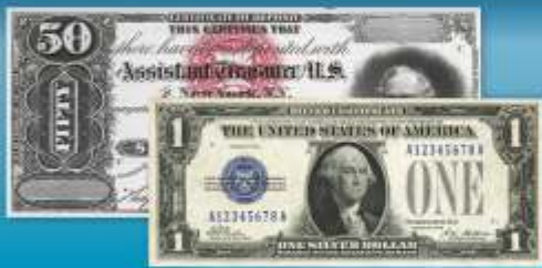
U.S. & Foreign Paper Money