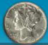
Mercury Dimes $1.15* up to $5,800