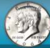
Pre-'65 Halves $5.75* up to $8