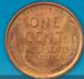
Wheat Cents 1.2¢* up to $2,500