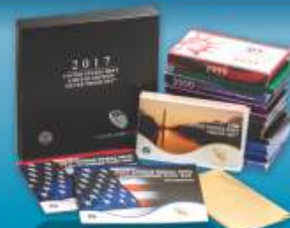
Proof & Mint Coin Sets