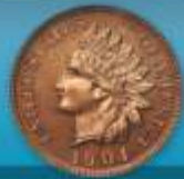
Indian Cents 20¢* up to $5,000