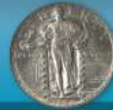
Standing Quarters $2.85* up to $2,800