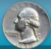
Pre-'65 Quarters $2.85* up to $400