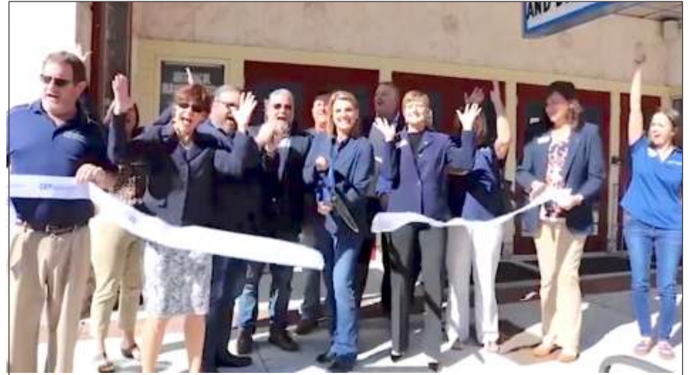
CEP Ambassadors having a ribbon cutting at the Walden Direct Primary Care 8th Ave Ocala. As you can see everyone is excited when the ribbon fell. Good luck in September. They are located at 111 SW Walden Direct Primary Care.

You can help create great futures by sponsoring a child to attend the Boys & Girls Club of Marion County. PO Box 4109 Ocala, FL 3448 352-690-7440