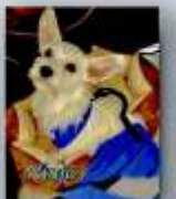
Ninja is paralyzed in his hind legs but enjoys runs with his wheels.

Your donations make it possible to provide medical care, food and shelter to animals in need. On behalf of all the animals, thank you for caring.