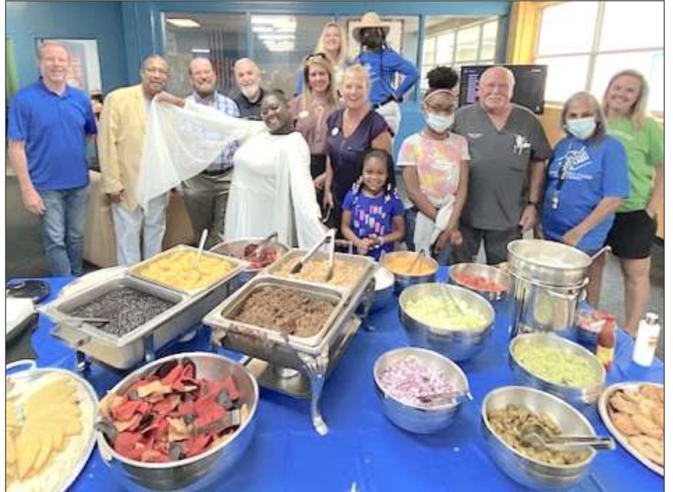
Pictured are Boys and Girls club and visitors at a open house hosted by Boys and Girls club / attended OBL club. Great spread of food and happy people . You can

High Springs, Florida 32643 Hours: Mon - Fri, 9:00 a.m. - 5:00 p.m.