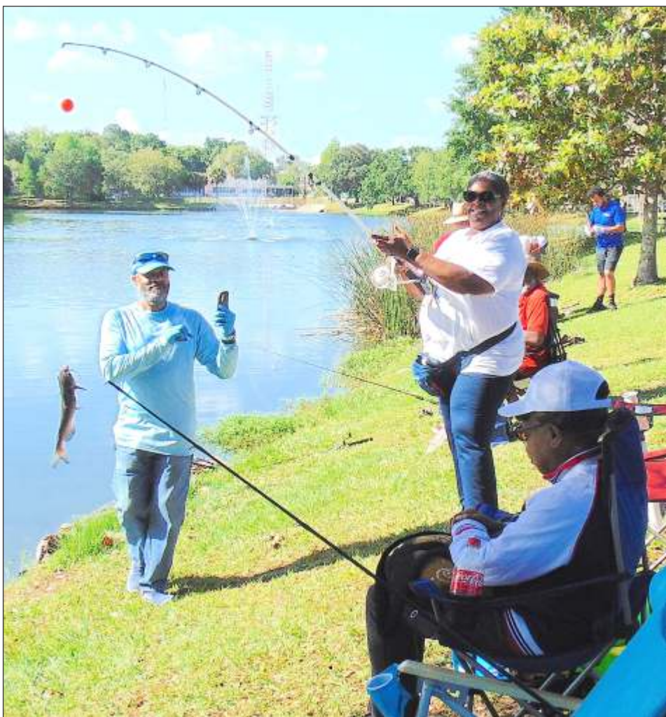
The 19th annual Senior Fishing Derby was a great success. Over a 125 registered fish were caught. Lunch was furnished. See page 6.