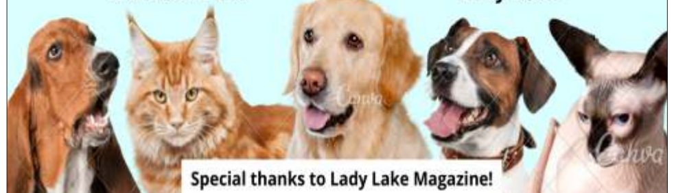
Special thanks to Lady Lake Magazine!