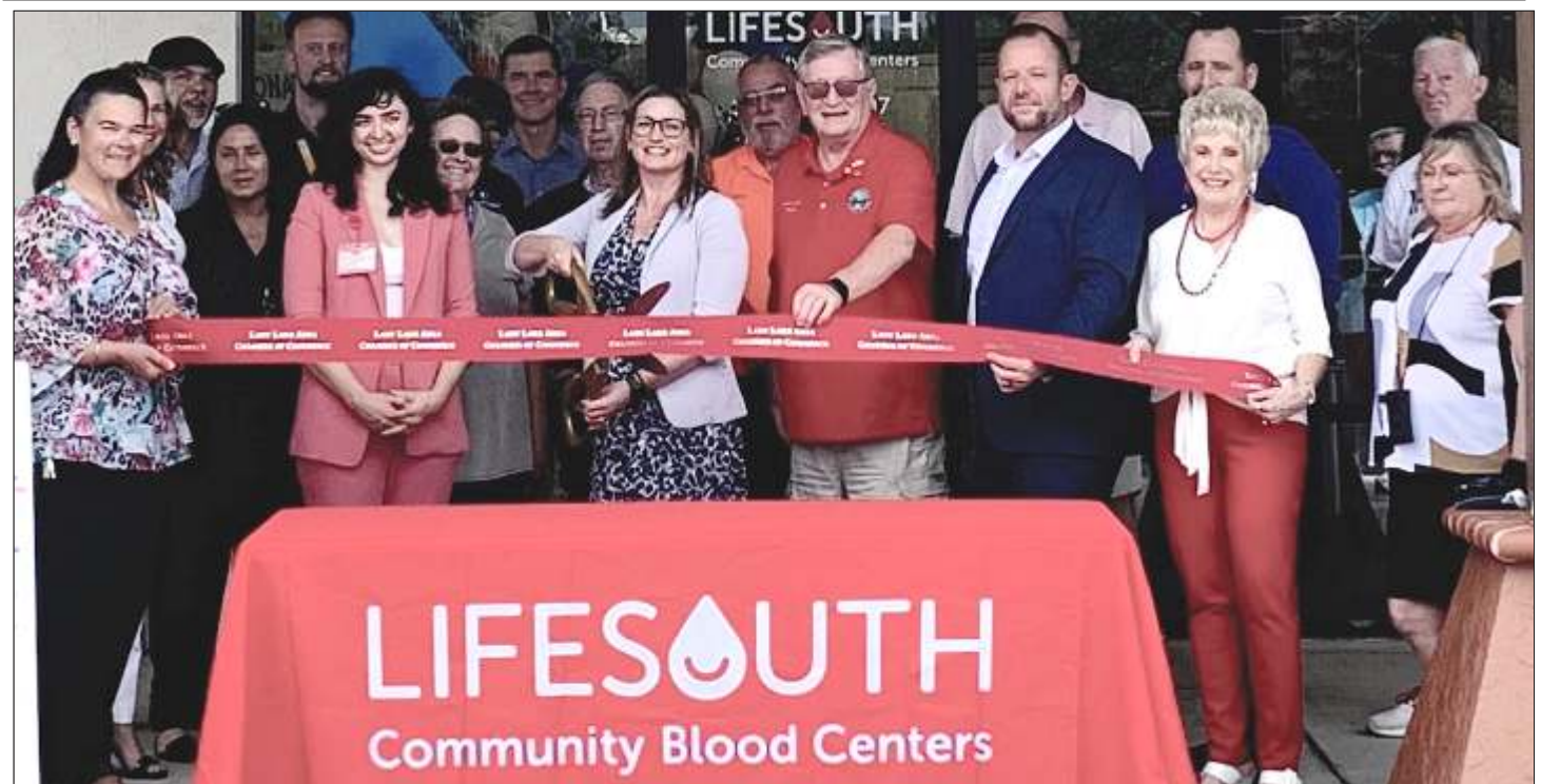
LifeSouth Community Blood Center blood center in The Villages. they are open for the community to stop celebrated the grand opening of its new Conveniently located at 978 Bichara Blvd, by and donate life-saving blood.