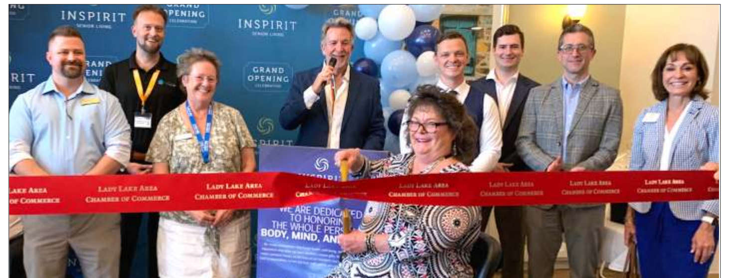
The Willows celebrated the completion celebration. The upgrades are so beautiful 300 to 900 sq ft. Take a tour meet our staff, of their remodel with a ribbon-cutting and inviting. Floor Plan Studio 1 & 2-br; join us for lunch.