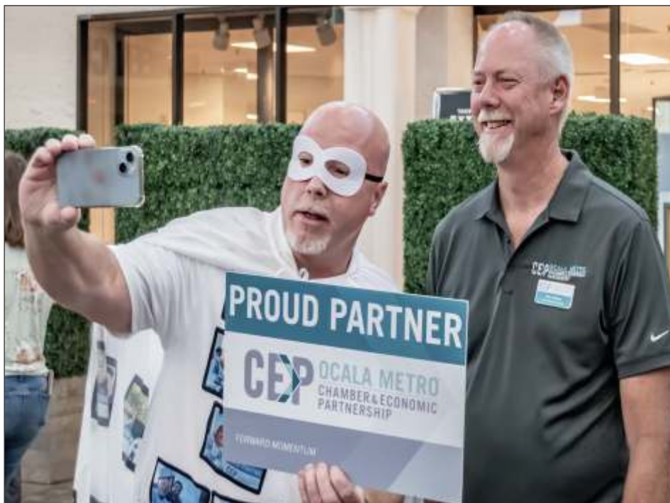
The CEP Ocala Chamber of Commerce has their Business after hours the third Thursday of every month. This month it

was hosted by the Paddock Mall.