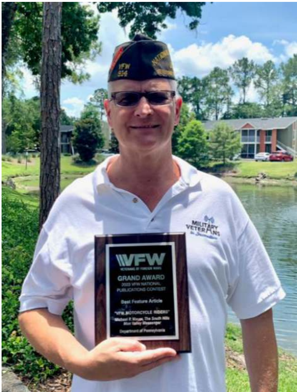
Ocala Post Writer Takes Top VFW Writing Award

A veteran of VFW McCullough-Mixon Post 4209 Ocala has won the top award for feature articles in the 2023 Veterans of Foreign Wars National Publications Contest.