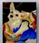
Ninja is paralyzed in his hind legs but enjoys runs with his wheels.

Your donations make it possible to provide medical care, food and shelter to animals in need. On behalf of all the animals, thank you for caring.