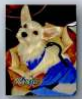
Ninja is paralyzed in his hind legs but enjoys runs with his wheels.

Your donations make it possible to provide medical care, food and shelter to animals in need. On behalf of all the animals, thank you for caring.