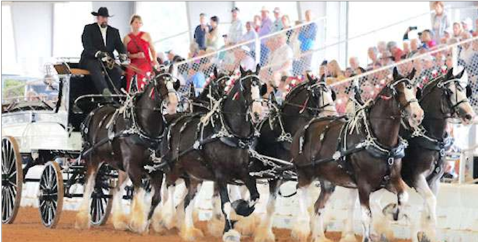
(Ocala, FL)- Tickets are on sale for Florida's premier Draft Horse Show, Grandview International, taking place February 1st through the 3rd. Twenty-one wagons and six to eight one ton Belgians, Clydesdales, and Percherons

will compete under the covered arena in what some describe as "organized chaos". Some Hitches have a single horse while others have an eight horse hitch, and everything in between. Hitches are put into competition based