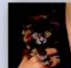
Fuchsla is a 15 week old paralyzed kitten full of love.

Bilbie is a 14 weeks old male brought to the HSMC with her brother Wombat! We believe they could be Xolaitzcuinli, or Xolo, which is Mexican hairless dog breed.