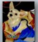
Ninja is paralyzed in his hind legs but enjoys runs with his wheels.

Your donations make it possible to provide medical care, food and shelter to animals in need. On behalf of all the animals, thank you for caring.