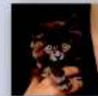
Fuchala is a 15 week old paralyzed kitten full of love.