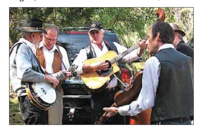
Page 8, Seniors Voice/Downtown – March, 2015