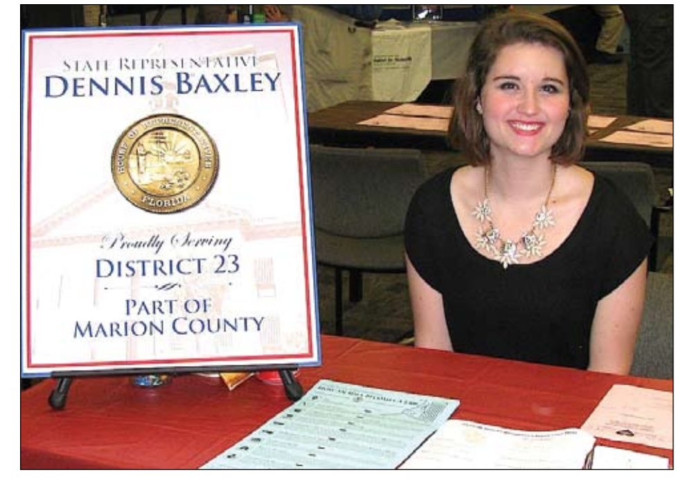
Above is the Dennis Baxely display - just one of the many displays at the Parade of Senior Services. View more pictures on page 8.