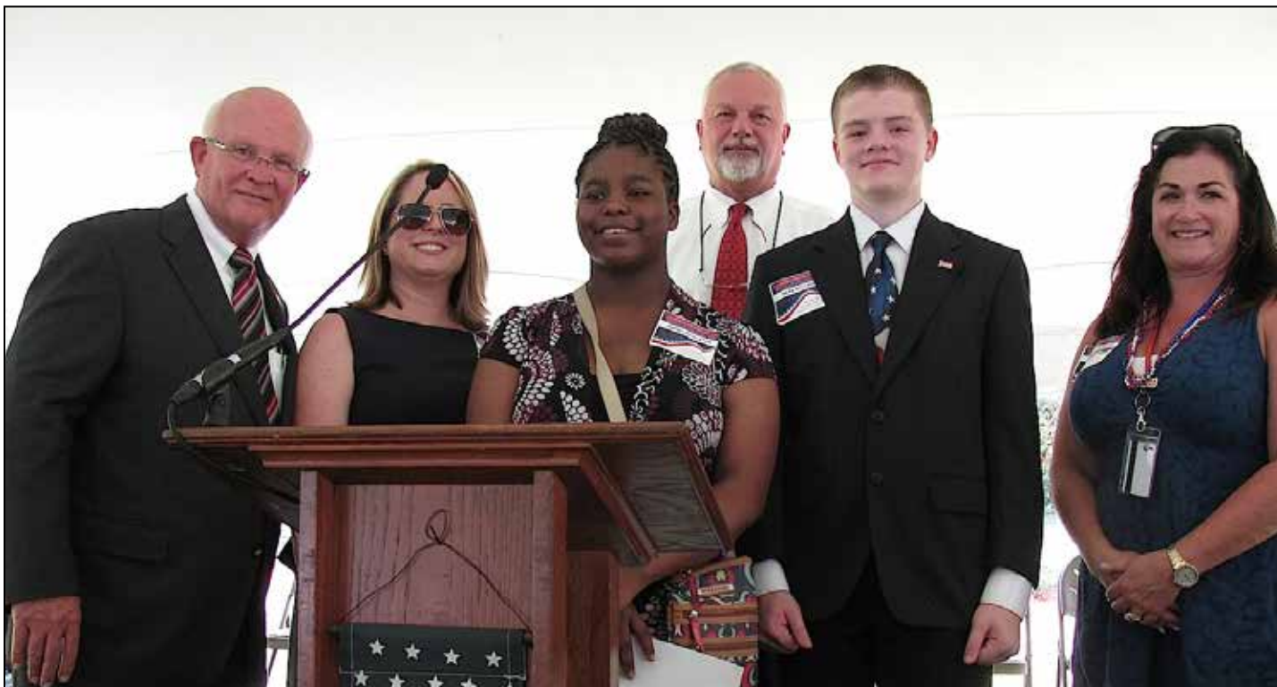
Local County and State officials, Veterans Day coordinators and more honor veterans on Memorial Day at Highland Park.