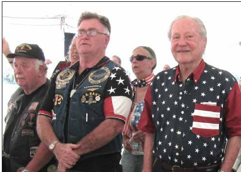
Former Prisoners of War, Vietnam Veterans honored during Memorial Day Ceremony.