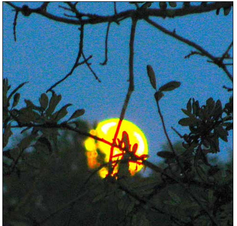
FULL MOON Oh boy is it! I could not help taking a picture of the moon going down. I could only see it through the trees. I have taken sunrises, sunsets, the animals, birds, and colts being born on the farm. Picture August 18, 2016 at 7 AM.

God Bless our Troops Support Our Veterans We Endorse The Constitution