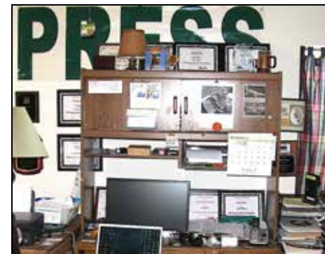
From the Messy Desk of the Publisher

Got an email from a Democrat who apparently looked up my LLC and said the following: I do not want you to deliver the Ocala DownTown / Lady Lake Magazine / Village Spectator / Seniors Voice of Ocala to my address. I thanked the person for being a reader and put them on our no throw list. We received many positive emails and phone