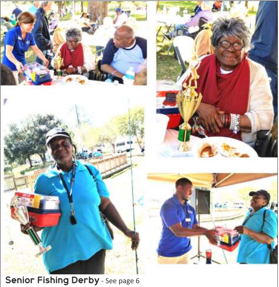
Senior Fishing Derby - See page 6